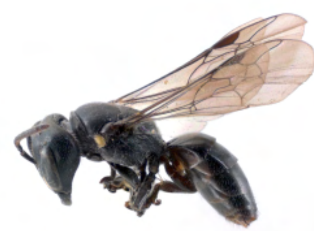
H. capitosus (female)