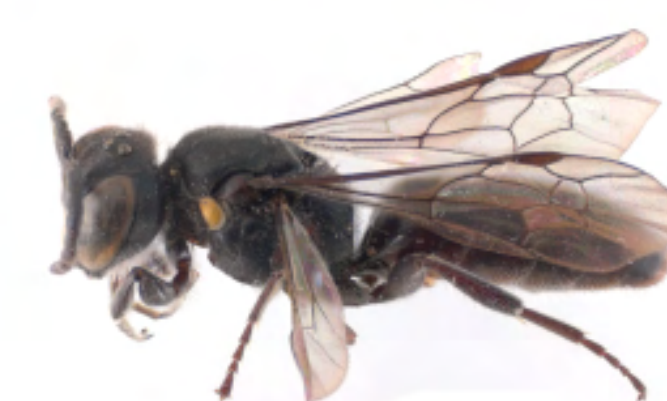
H. relegatus (male)