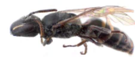
H. matamoko (female)