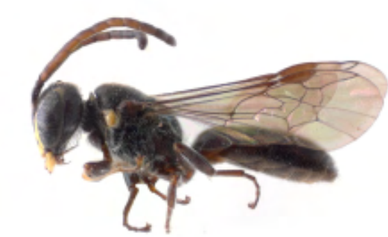
Hylaeus agilis (male)