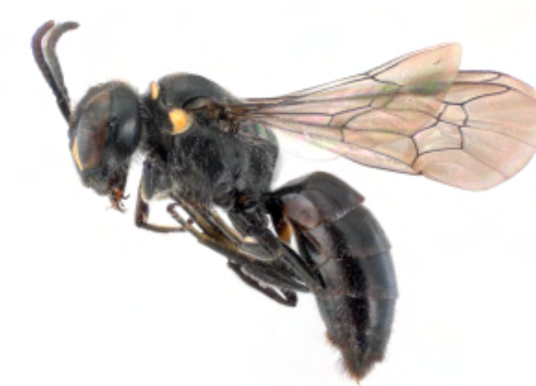
H. relegatus (female)