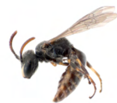
H. matamoko (male)