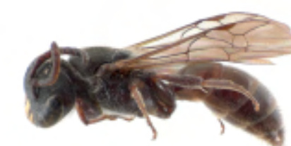
H. kermadecensis (male)