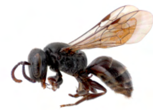
H. kermadecensis (female)