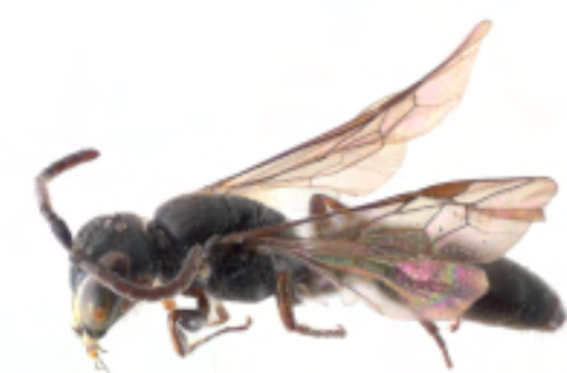
H. capitosus (male)