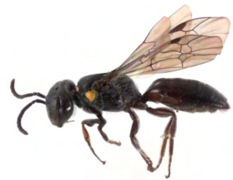
Hylaeus agilis (female)